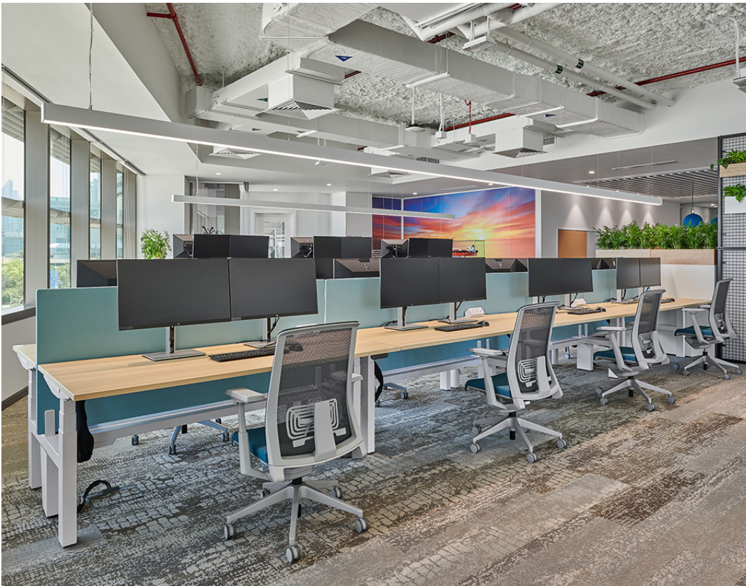
A workspace that not only enhances efficiency but also makes working a pleasant experience, encouraging collaboration, promoting synergy and collective growth.

Expansive windows allow natural light to fill the entire office, giving workers a mood-boosting connection to the outdoors.