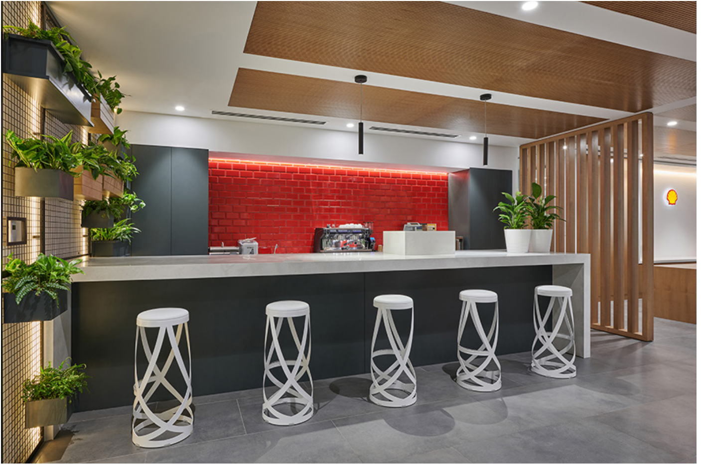
The Shell café, also known as the Energy Hub, has been adorned in lively colours. Like the reception area, this space defines Shell's identity, with its innovative design and commitment to sustainability.